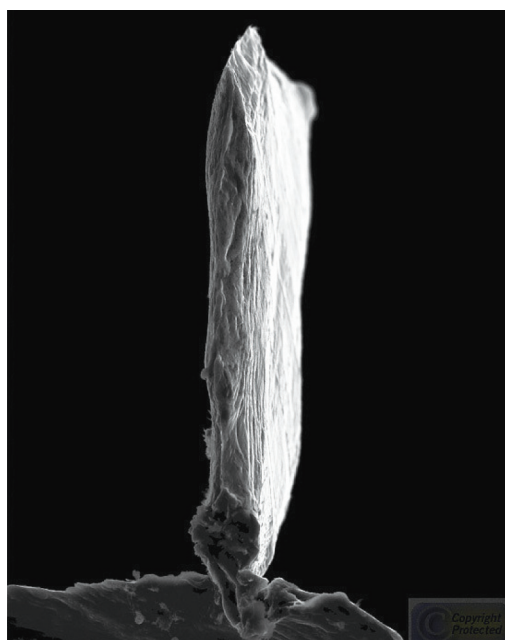
Figure 2. “NanoMaiastra: Brancusi, In Memoriam” (© 2008, Chris Orfescu, used with permission)

Altamira, Spain, 13000 B.C. The man grabbed a piece of charcoal from the cave floor, put his hand on the wall, and drew its contour without knowing that he was using a nanomaterial to create a piece of artwork. He just wanted to draw his