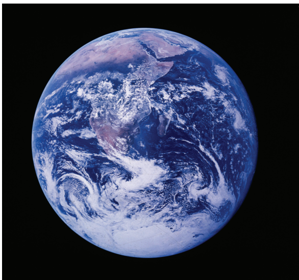
Figure 2. Earth seen from the cosmos

It is obvious that any technology carries both advantages and disadvantages for the environment in which it is produced or applied. Therefore, any technology is characterized by a certain technological aggressiveness, that is, the extent to which it affects or does not affect the environment in which it was produced or it was applied.