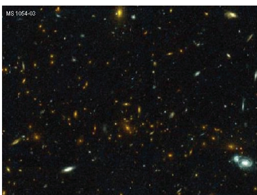
Figure 1. Galaxies seen from 8 million light years 1 (left), and 2 million galaxies 2 (right)

We believe that our universe is a calm universe. At its turn, our solar system is a system with a high degree