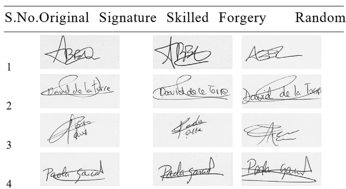
Table 1. Samples of MCYT database

Database used in experiment is collected from MCYT-75 offline signature (Frias-Martinez, Sanchez, & Velez, 2006; Vargas, Ferrer, Travieso, & Alonso, 2011). Each signature is signed using a WAMCOM Intuous inking pen. Database contains 75 users in which every user has 15 genuine and 15 forgery signature samples. The forgery signature is the mixture of random, simple and skilled forgeries. Some samples of MCYT database is shown in Table 1.