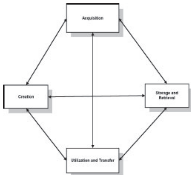
Figure 1 Generic Knowledge Management Model

Knowledge management is a methodology grounded in the generic process-centric model in Figure 1.