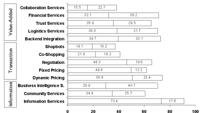
Figure 1: Current and planned service offering (percentage of marketplaces that offer (left beam)/plan to offer (right beam) a service, n = 233 to 244

The results of the survey show that currently the service offering mainly consists of basic information services and core transaction services. However, the planned development of the surveyed marketplaces indicates that all services but especially value-added services such as logistics, financial, backend integration and trust services are being adopted widely by marketplaces in the near future.