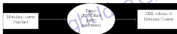
Figure 5: Editor mediated metadata schema generation

However, ArcCatalog does not offer any distributed metadata search engine. However, it generates open format XML schema that could be used in any standard browser to create customized query tools. This could be linked with ArcIMS HTML viewer to search and displays a thematic map. This page could be created using Arc XML (AXL) rendering code. User request can be sent to a servlet, to dynamically render map service using the stored AXL code. The exploration environment could be further enhanced by the ArcIMS Java Custom Viewer ensuring easy and smooth access to spatial dataset.