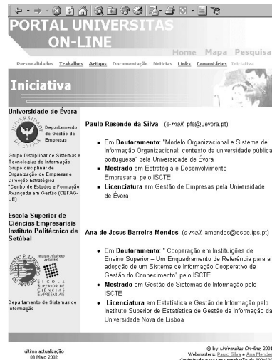
Figure 2 - UniversitasOnline Portal

ker between higher education institution, in some HEI or researchers publicity yours works and document (best practice and benchmarking) or some service provider they have, and others institution, research and others person are "clients", service request (document, works, etc.).