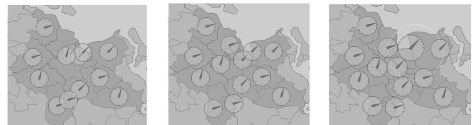
Figure 3: Example of icon positioning and browsing with a cartographic lens