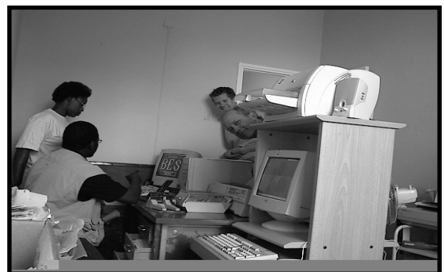
Figure 3: Despite the existence of new powerful computers, the LIS are running on the old computers.

The LIS perspective informs that the chosen strategy for introducing change should depend on system quality and its business value. This