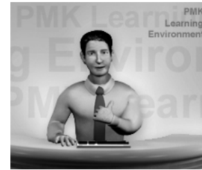
Exhibit 2. Frame showing VICTOR's gestures when the student does an exercise correctly

In the fifth stage, Implementing the LC, the architecture components and animations were implemented. A prototype of VICTOR was integrated to the PMK. After concluding the integration, the last stage of the methodology, Assessing and Refining the LC, was carried out.