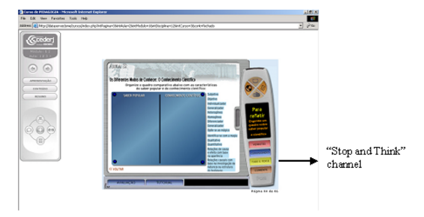
"Stop and Think" channel — Game - logical-mathematical intelligence < http://www.cederj.edu.br/cecierj/> Retrieved. September 26th, 2006