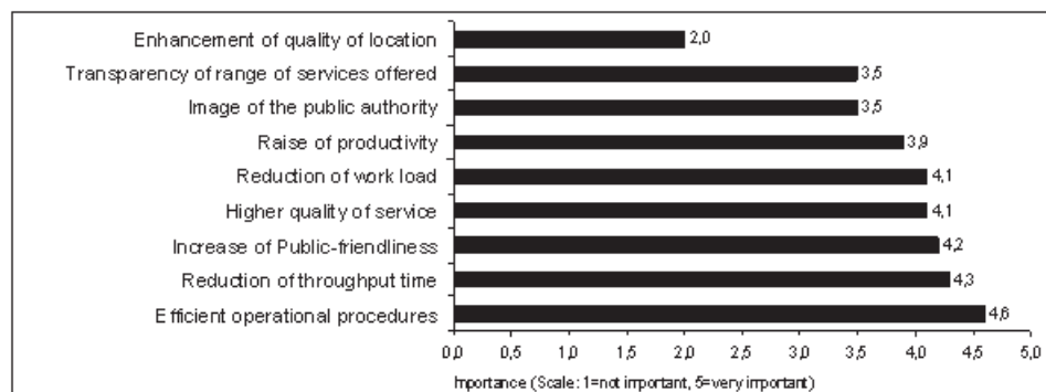
Figure 1. Objectives on implementing e-government (Scheer et al., 2003)

The transition from traditional administrative processes to E-Government processes means not only an adoption of previous (non-electronic) procedures onto electronic ones but also it opens new possibilities and challenges regarding reorganization and process reengineering (Wimmer, 2002, pp. 149-156). Before the implementation of new software a process analysis and design should be conducted (Matheis et al., 2006). A use of Business Process Management (BPM) methods after important technical decision or implementation of new software can only yield to a sub-optimal result. Nevertheless most of actual E-Government