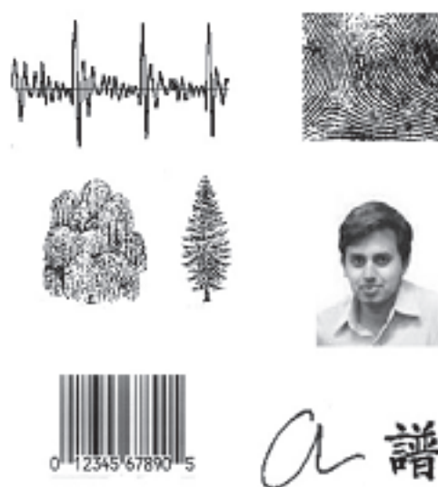
Figure 1. Examples of patterns: sound wave, fingerprint, trees, face, bar code, and character images (Jain et al., 2000)

productive research, pattern recognition continues to be an active area of research because of many unsolved fundamental theoretical problems as well as an increasing number of applications that can benefit from pattern recognition (Polikar, 2006). However, rapid advances in computing technology not only enable us to process huge amounts of data, but also facilitate the use of elaborate and diverse methods for data analysis and classification. Besides, demands on pattern recognition systems are rising due to the availability of large databases.