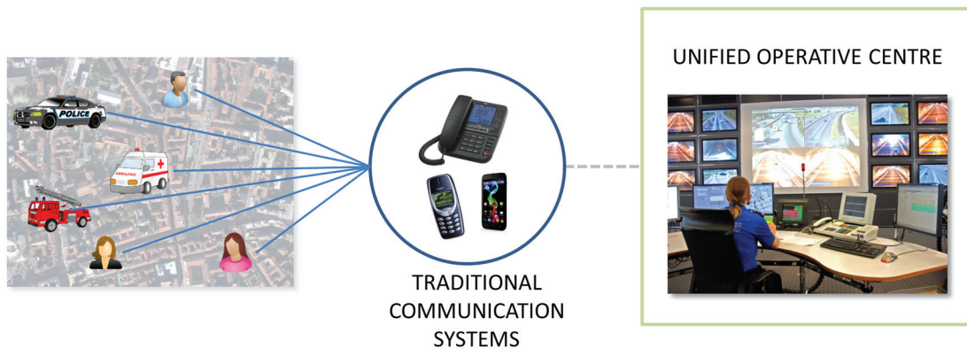
Figure 1. Logical architecture of a traditional emergency management system