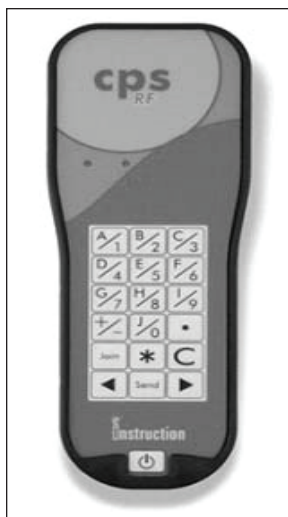
Figure 1. A clicker