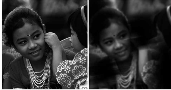
Figure 1. Normal vision vs. Vision with Retinopathy

of Figure 1 we observe the image as blur, because blood is not clear as water and the black region in the image represents the fatty material depositions over retina.