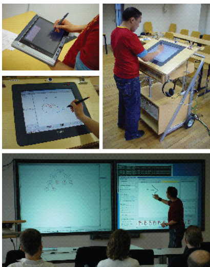
Figure 1. Pen-based interfaces commonly used in classrooms: Tablet PC (top left), graphics tablets (middle left and top right), and electronic whiteboards (bottom)

classroom teaching, it is generally agreed that they make useful, gaining complements to existing classes, and their value for education is generally accepted (Hürst, Müller, & Ottmann, 2006). While manual production of comparable multimedia data is often too costly and time consuming, such “lightweight” authoring via automatic lecture recording can be a more effective, easier, and cheaper alternative to produce high quality, up-to-date learning material. In this article, we first give a general overview of automatic lecture recording. Then, we describe the most typical approaches and identify their strengths and limitations.