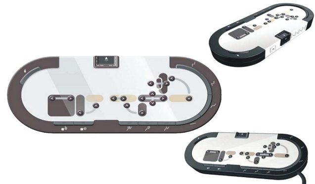
Figure 2. Screenshot of flash animation of a virtual seat remote control concept (with kind permission from rc research GmbH and Lufthansa AG)

launch stage. In most cases, 3D virtual environments are used to replicate the in-store shopping experience. The participant is placed in a virtual store, where he or she can walk through the store, interact with his or her environment, and purchase all the products he or she wants. These systems offer significant advantages to the researcher because he or she has complete control over all aspects concerning the shopper's environment as an experimental design. According to Bock and Treiber (2004), shopper research systems nowadays differ greatly in the complexity of the store simulation, the interactivity, the mode of presentation (panoramic projections of virtual stores in a "cave" visualization facility versus wide-curved screens and head-mounted displays), the mode of data collection, and budget considerations. Campo, Gijsbrecht, and Guerra (1999) summarize validation studies and demonstrate the ability of virtual shopping environments to accurately reflect in-store shopper behavior.