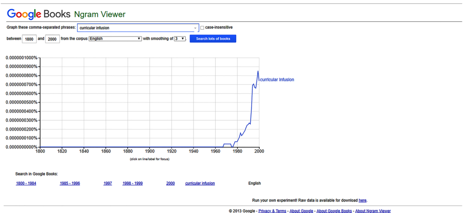
Figure 1. “Curricular Infusion” in Google Books Ngram Viewer

Curricular infusions are seen as practical in enabling “a viable, cost effective method because it obviates obstacles and limitations inherent in the creation, approval, and implementation of new courses” focused on the topic (Guerin, 2009, p. 613). This cost savings also extends to institutional levels, such as the infusing of international perspectives across a range of core curriculums, disciplines, and