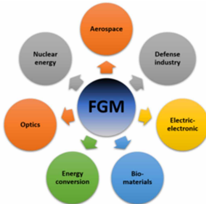
Figure 1. Application areas of FGMs

Depending on these applications, considering the characteristics such as abrasion, corrosion, chemical stability, electrical and thermal conductivity, providing different properties in different layers of a single material structure makes FGMs indispensable (Edwin, Anand, & Prasanna, 2017; El-Galy, Saleh, & Ahmed, 2019; A. Gupta & Talha, 2015). FGMs are often structurally divided into two types. In the first kind FGMs, the composition in the material structure changes step by step, while the composition in the second variant shows a continuous change. In this context, FGMs can be produced from different layers and using different materials in each layer. On the other hand, FGMs with different grain sizes can be produced in the same structure by obtaining materials with different grain sizes in each region (lower-middle-upper) (Chi Zhang et al., 2019). This type of FGMs is shown schematically in Figure 2.