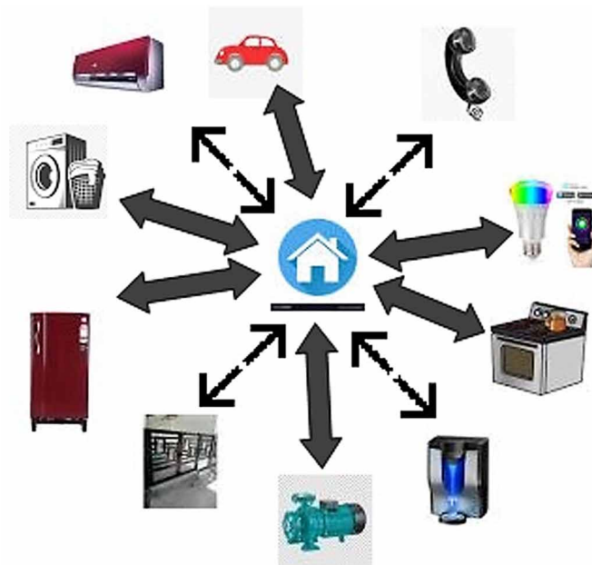
Figure 1. IoT device example for Home automation

IoT is not a new technology; it is a combination of various traditional technologies like Wireless Sensor Network (WSN), Cloud computing, Big data analytics, Radio-Frequency Identification (RFID), Location-based services, and Automation. Internet of Things mainly deals with constraint devices. So it is unable to fulfil all the requirements like Storage capacity, Execution speed, Captured data Transferring capabilities, and Energy. In this case, Cloud computing will play a major part in IoT devices to provide a huge amount of memory for storage.