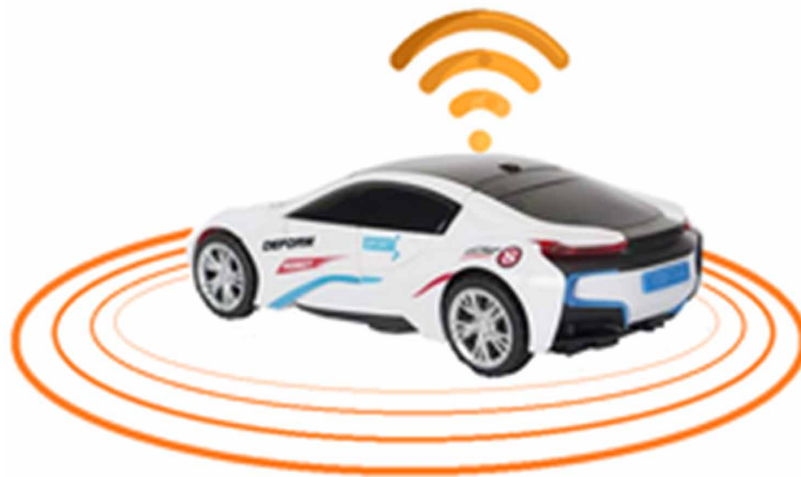
Figure 1. Autonomous vehicle

Blockchain is a newly established secured technology. It is a novel approach to the distributed database. A blockchain is a data structure that makes it possible to create a digital ledger of data and share it among a network of independent parties (Hori & Sakajiri, n.d.). It is a growing list of records, called blocks which are linked using cryptography. Each block contains a cryptographic hash value of the previous block, a timestamp and transaction information. It allows a peer-to-peer communication without any intermediary. There are three types of blockchain: First: Public blockchain, Second: Private blockchain, Third: Hybrid blockchain. All the three types of blockchain use cryptography to allow each participant on any given network to manage the ledger in a secure way without the need of central authority (Hori & Sakajiri, n.d.). The last few years, the blockchain has gained widespread traction and is constantly attracting new investments. A wide range of industries, including finance, insurance, healthcare, logistics and supply chain management are starting to discuss and test blockchain technology in a number of use cases (Saranti et al., 2019). The main application of blockchain are in financial system, healthcare, smart grid technology, business and industry, smart parking system, cyber security, information security, big data security etc.