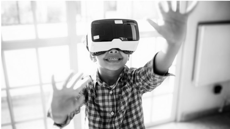
Figure 1. Experiencing virtual world through virtual reality headset (Ashworth, 2020)

The term “ virtual world ” needs a simple, meaningful understanding of what it means and what it means to have a virtual world. Mostly, it needs to underrate the relevance of the virtual world in the disabled sector, which can be used to help the individual live. There are a lot of schools of thought on virtual worlds, but unfortunately, they have not yet brought the concept to clarity to clarify the benefits for the disabled. If technology can do everything, which is unbelievable, then it is also essential to see in the other possible directions. Through this, disabled people will benefit, along with special educators and scientists. So far, the conceptual meaning or definition of a virtual world has not been well-defined. The ability to predict a technical definition has its own benefits and gives users a wide range of experience. However, because a virtual world is defined by a mix of different technologies, it makes it hard to tell which technologies have similar features. For example, a smartphone has multiple advantages with different technologies. In this section, we examined technology and its advancement in the field of learning disabilities (LD). According to one of the eminent researchers on learning disabilities, “ Learning disabilities are not a prescription for failure. With the right kinds of instruction, guidance and support, there are no limits to what individuals with LD can achieve ” said by Sheldon H. Horowitz, 2014 (p3) (Cortiella & Horowitz, 2014).