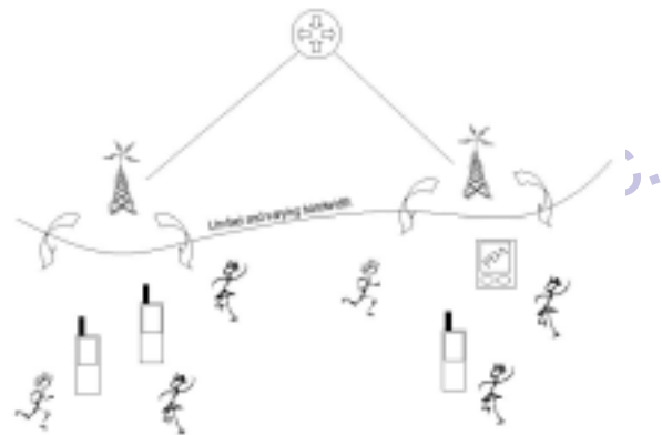
Figure 1: In a wireless scenario, excess traffic must be avoided

and buffer requirements must not cause the protocol to use most of the available bandwidth for control data.