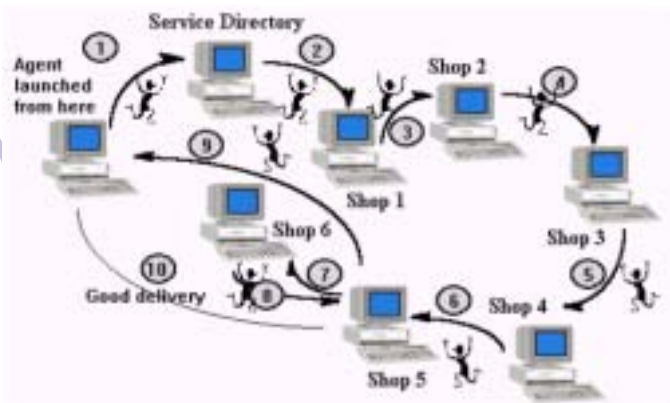
Figure 2: Agent-based shopper assistant

PAWS is an Agent based library of information. Based on the owner's preferences and the index services, such as Alta Vista and