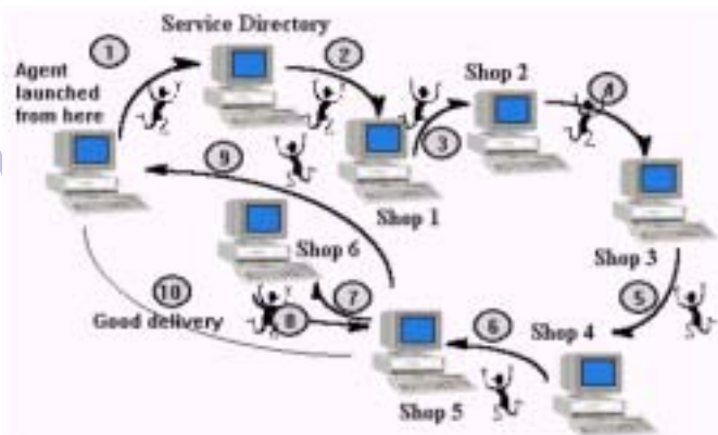
Figure 2: Agent-based shopper assistant

PAWS is an Agent based library of information. Based on the owner's preferences and the index services, such as Alta Vista and