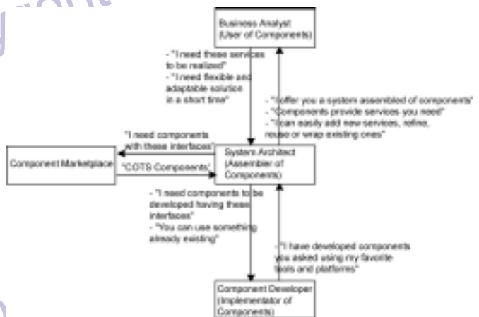
Figure 2: Dialogs between actors in the development process

According to traceable usage of component thinking presented above, three human roles in the system development process using components can be defined: business analyst (user of components), system architect (assembler of components) and component developer (implementator of components). For a business analyst a component represents a clear, rigorous, implementation-independent specification of an encapsulated business service. For a system architect, a component is an encapsulated building block of the system architecture with fully specified interfaces to the rest of the system. For proper assembling of the components into an overall system solution implementation details are not important as long as exposed interfaces are guaranteed. Component developer “opens” a black-box component and provides component implementation according to previously defined business and system requirements, and interfaces that should be realized. Dialogs between these three roles in the development process, as well as their views on components are presented in Figure 2. In this way the same set of component concepts and way of thinking are used throughout the development process, providing traceability from business concepts and processes to implementation artifacts.