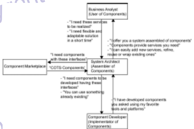
Figure 2: Dialogs between actors in the development process

According to traceable usage of component thinking presented above, three human roles in the system development process using components can be defined: business analyst (user of components), system architect (assembler of components) and component developer (implementator of components). For a business analyst a component represents a clear, rigorous, implementation-independent specification of an encapsulated business service. For a system architect, a component is an encapsulated building block of the system architecture with fully specified interfaces to the rest of the system. For proper assembling of the components into an overall system solution implementation details are not important as long as exposed interfaces are guaranteed. Component developer “opens” a black-box component and provides component implementation according to previously defined business and system requirements, and interfaces that should be realized. Dialogs between these three roles in the development process, as well as their views on components are presented in Figure 2. In this way the same set of component concepts and way of thinking are used throughout the development process, providing traceability from business concepts and processes to implementation artifacts.