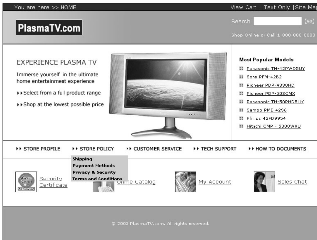
Figure 1: Optimized E-commerce Interface

point in the product picture were on the interface to represent the design feature of “displaying brand-promoting information,” and the VeriSign seal in the lower left corner was used to present the design feature of “displaying seals of approval or third-party certificate.” The last dimension, the social-cue design dimension, relates to embedding social cues into web site interfaces via different communication media, and it is a relatively new design strategy being suggested by some HCI researchers (Basso et al., 2001; Riegelsberger & Sasse, 2001; Steinbruck et al., 2002). The first feature of the social-cue dimension, which was “inclusion of representative photograph or video clip,” was represented by displaying an employee photo in the lower left corner of the interface. The second feature of the dimension, which was “use of synchronous communication media,” was represented by displaying a hyperlink to a synthetic online sales chat. The interface was implemented using professional web page development tools in conjunction with a graphic editing software package. The interface was accessible on the world wide web1.