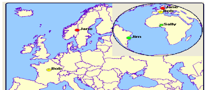
Figure 1: Real-Time presence information on enhanced instant messaging client maps

The automatic buddy placement just described works fine if users tend to remain in one spot, but it seems as if no one will tolerate being tied to a desk anymore. A technique for automatically determining user locations in real-time is in order. When it comes to accurate real-time location information, there are a number of possibilities including GPS and cell phone triangulation. For the enhanced client we chose a slightly different alternative: Radio Frequency Identification (RFID). RFID provides a mechanism to uniquely identify objects. Good examples of this type of system in current use include the Mobil SpeedPass and SmartTag or EZ-Pass systems for toll booths. These systems work because they are able to uniquely identify a tag using radio waves and link this information to a credit card. RFID systems are enjoying rapid adoption and some expect RFID tags to eventually be integrated to almost all the products we buy (much as barcodes currently are). This wide support infrastructure is one of the things that made RFID attractive for use in the enhanced client. RFID merely requires carrying a small tag, rather than a separate device as would be needed for GPS or cell phone triangulation. The trade-off is that an external device is needed to read the RFID tags, and several of these devices would be needed to gain good coverage of any particular area.