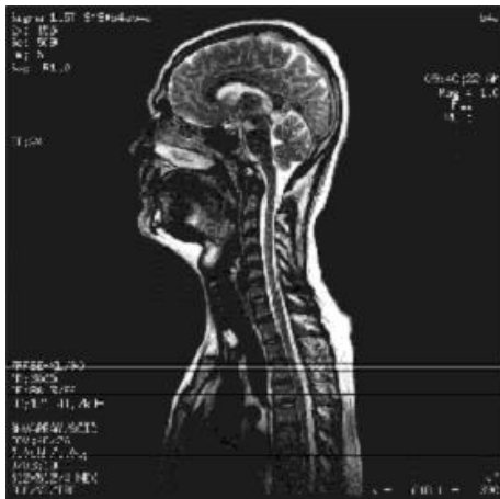
Figure 2. Image reconstructed using the ME-NN algorithm.