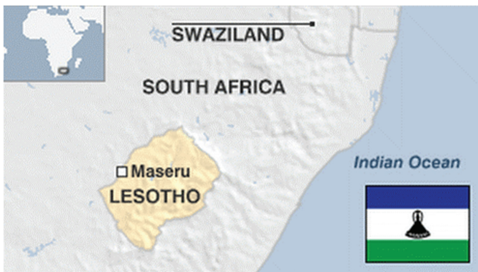
Figure 1. Lesotho, enveloped only by South Africa

Specifically, the reforms instituted have led to a series of developments that inform the emergence of a new curriculum, especially in basic and secondary education, to address the socio-economic needs of citizens in line with the realities of the present day. Notable among the various educational reforms in Lesotho is that the education of persons with disabilities has undergone a metamorphosis, even going so far as to adopt the Salamanca Framework for Action (UNESCO, 1994), with adoption and appreciation of the philosophies of inclusive education (Adigun, 2021).