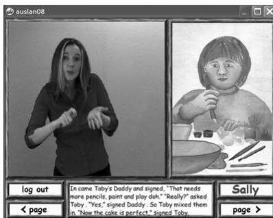
Figure 2. Story