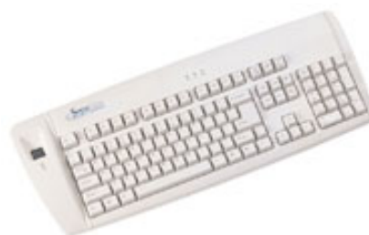
Figure 4. onClick®'s PCMCIA FingerPrint™ Reader 4