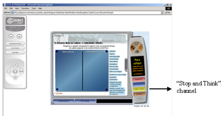
“Stop and Think” channel – Game - logical-mathematical intelligence < http://www.cedercj.edu.br/cecierj/ Retrieved September 26 th , 2006